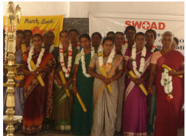
(International Women Day Procession and honouring of Group Leaders)